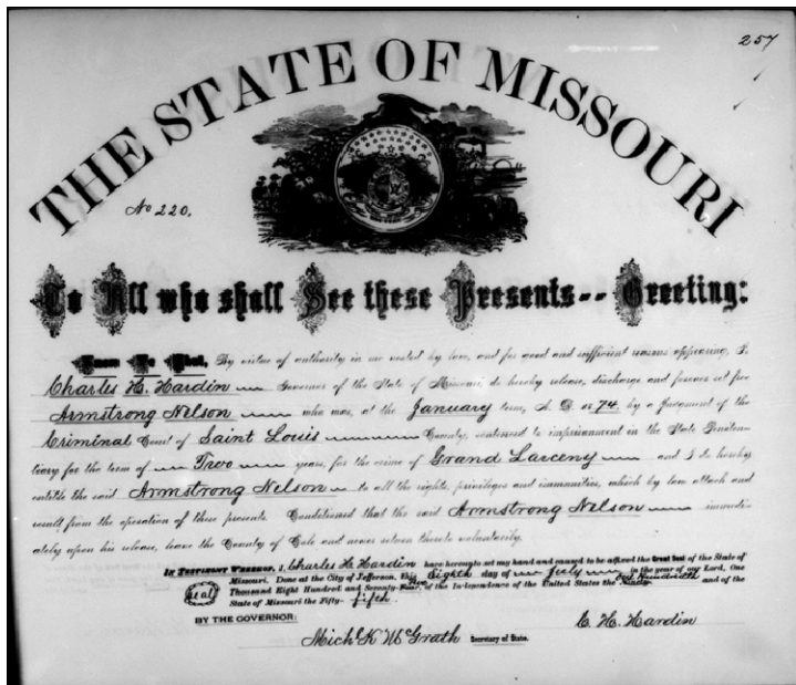
Figure 5 | Missouri Governor Charles H. Hardin's 1875 pardon of Armstrong Nelson for Grand Larceny